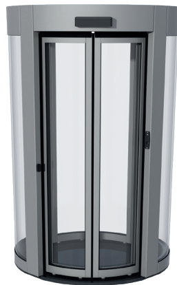
HiSec 2 10-2D

The HiSec 2 is equipped with electronic safety features that reverse the motor to re-open the door upon detection of an obstruction. The door fully opens to allow the obstruction to be removed after which it attempts to re-close.